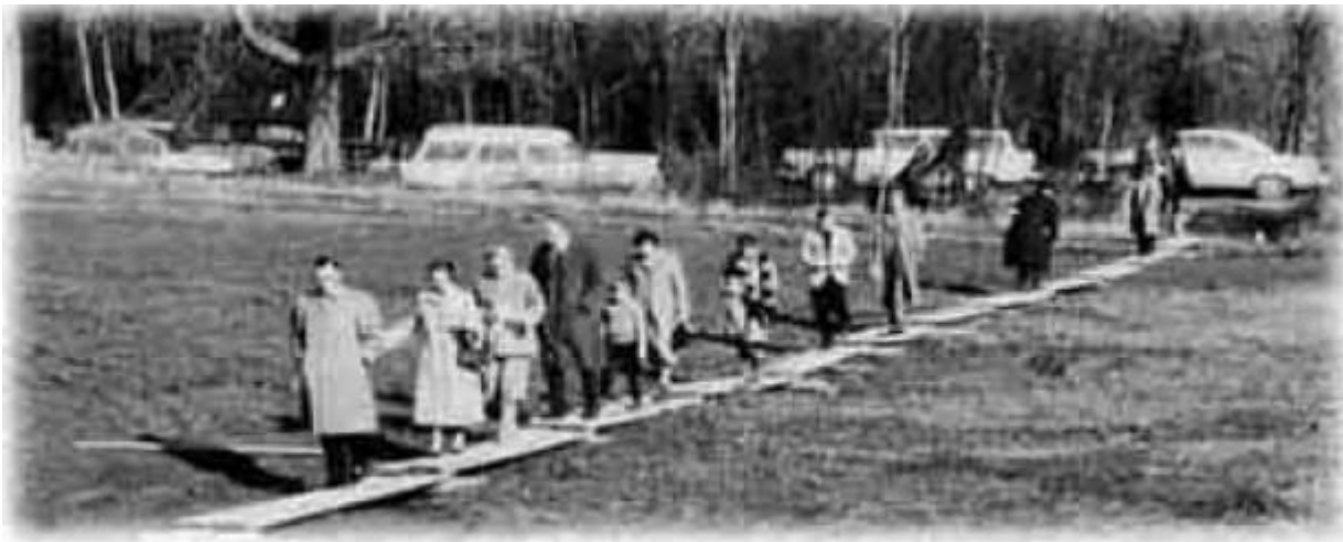
Some lay-led Unitarian fellowships, like the one founded in Princeton, New Jersey in 1949, grew into churches with ordained ministers. Here, members arrive for a service in their unfinished building in 1958. Many other fellowships, however, remained lay-led.

graphic: UU Fellowship in 1958 at new site