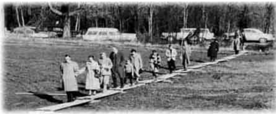
Some lay-led Unitarian Fellowships, like the one founded in Princeton, New Jersey in 1948, grew into churches with ordained ministers. Here, members arrive for a service in their unfinished building in 1958. Many other fellowships, however, remained lay-led.