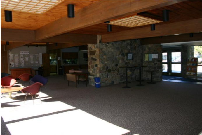
Figure 3 - Robinson Lounge

Robinson Lounge Friday, Saturday & Sunday $100.00 for the first two hours (or any fraction.) $70.00 for each additional hour (or any fraction.)