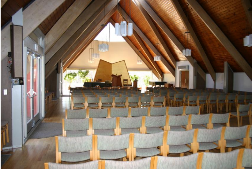
Figure 2 - Channing Hall facing front