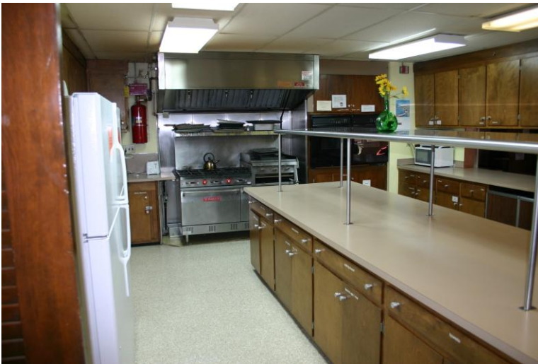
Figure 5 - Kitchen

Kitchen (full) Friday, Saturday & Sunday $130.00 for the first two hours (or any fraction). $70.00 for each additional hour (or any fraction)