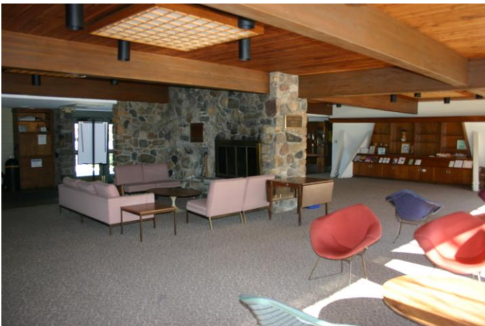
Figure 4 - Robinson Lounge