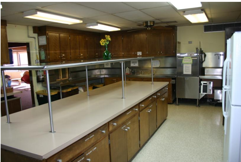
Figure 6 - Kitchen