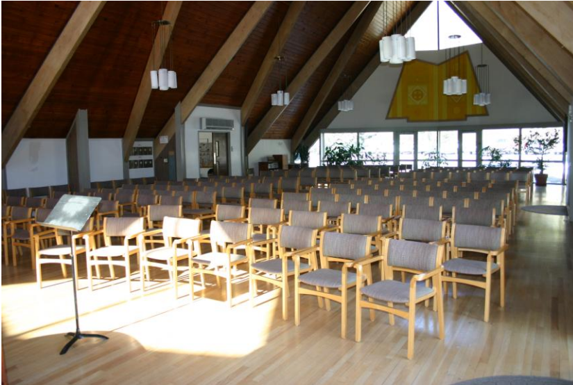
Figure 1 - Channing Hall facing back

Size: 80' x 42' Capacity: 300 Flooring: Hardwood Food: Allowed Air Conditioning: Yes