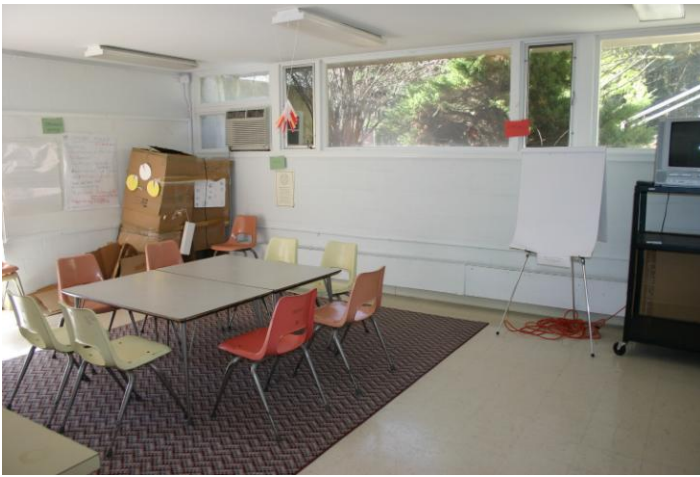
Figure 8 - Classroom

Classrooms Friday, Saturday & Sunday $60.00 for the first two hours (or any fraction). $30.00 for each additional hour (or any fraction)