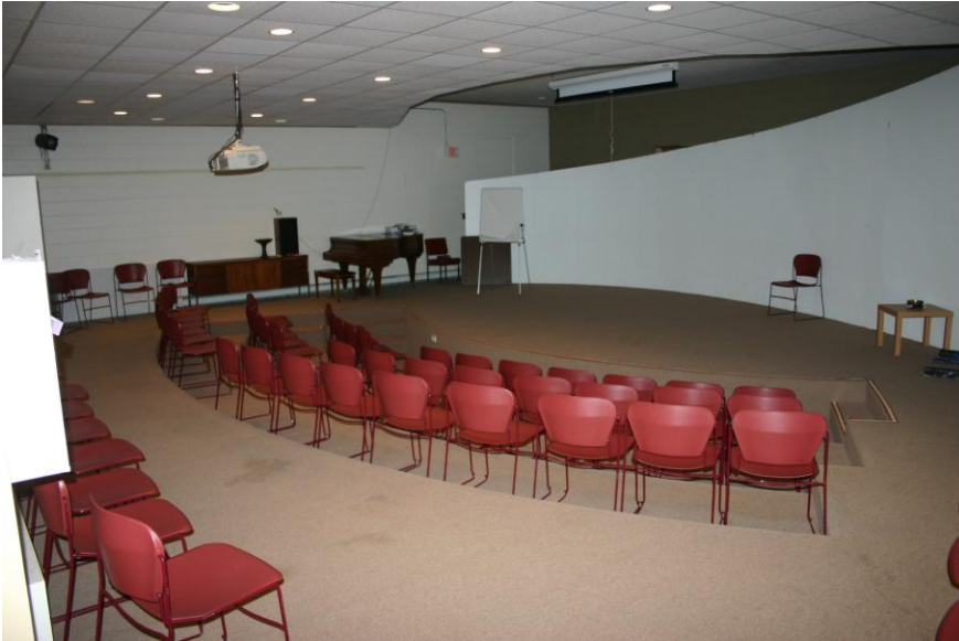
Figure 7 - Sophia Fahs Theatre

Size: 34' x 39' Flooring: Carpeted Food: Not Allowed Air Conditioning: Yes Stage: Yes