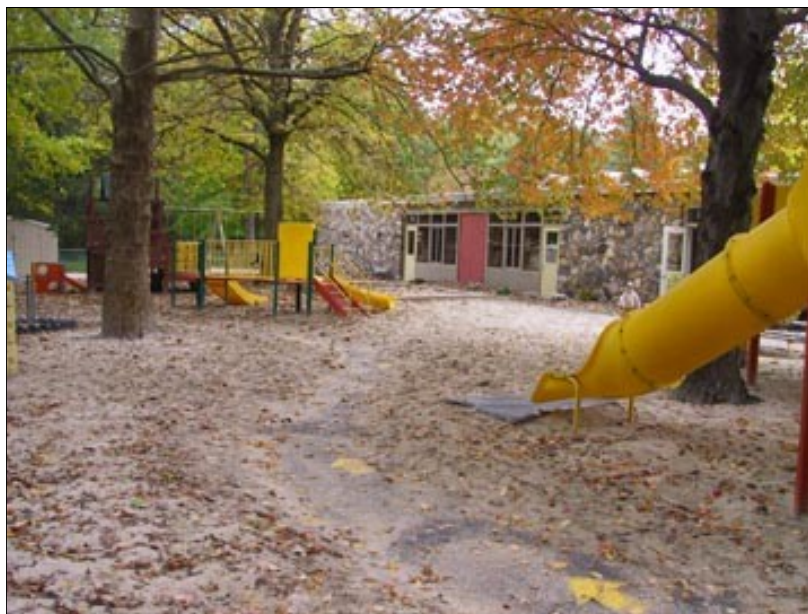
Playground used by UUCP and CHNS